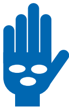
Hijack of Public Transport