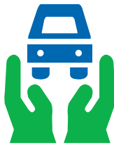
Public Transport Double Cover