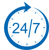
Emergency Assistance Evacuation & Repatriation